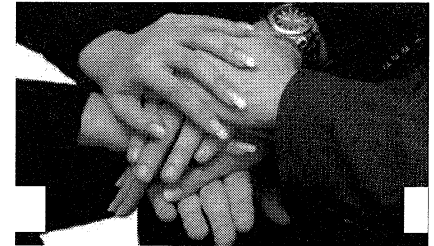
TERAS Programme 16 Nov 2012